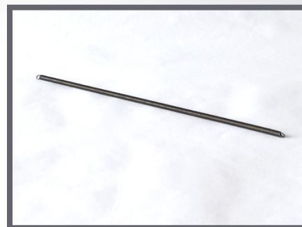
Retaining Spring – Dish Knife