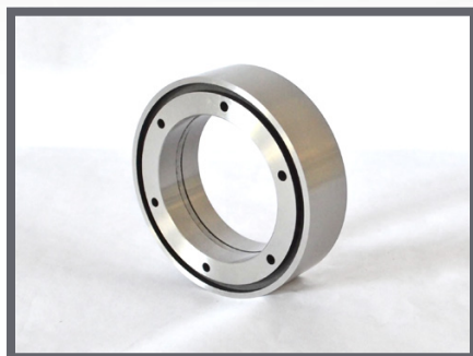
Shear Slitter Anvil Knife 3.57" OD

Walt Powley Inline, Inc. anvil knives are manufactured to exacting tolerances from high quality D2 tool steel.