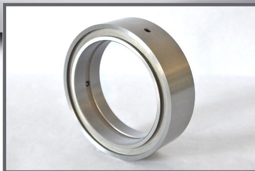
Shear Slitter Anvil Knife 6.30" OD

Walt Powley Inline, Inc. dish / circular knives are manufactured to exacting tolerances from high quality D2 tool steel and include a specialized cutting edge to maximize knife life and provide superior cut quality.