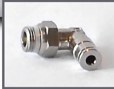
Male Elbow Swivel