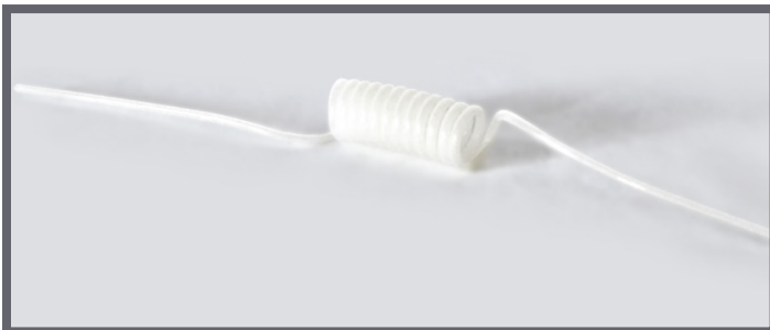
Recoil Tubing - 1/8"